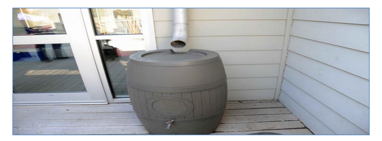
Figure 3: - A rain barrel is a simple rainwater harvesting system. Homeowners commonly use the stored water to irrigate their gardens. Image by Walton LaVonda, USFWS (public domain).

Figure: - 2 : The components of a rainwater harvesting system include (1) the collection system consisting of the roof surface and gutters that capture rain water and send it to (2) the inlet filter, a screen that catches large debris. (3) The first flush diverter removes debris not captured by the inlet filter from the initial stream of rainwater. (4) The storage tank is composed of food-grade polyester resin material approved by the U.S. Food and Drug Administration (FDA), which is green in color and helps to reduce bacterial growth. (5) The overflow is a drainage spout that releases excess water if the storage tank is full. The (6) control system monitors the water level and filtration system, and the (7) treatment system is responsible for filtration and disinfection, treating water until it is potable (safe to drink). The (8) pump moves water through the system to where it will be used, and the (9) backflow preventer ensures that water cannot flow backwards through the system in cases of low water pressure (when the storage tank is low). (10) The flow meter (with data logger) measure water production. The (11) power supply may rely on conventional energy sources or solar energy, and the (12) water level indicator monitors the water level in the storage tank. Caption modified from and image from Office of Energy Efficiency and Renewable Energy, Department of Energy (public domain).